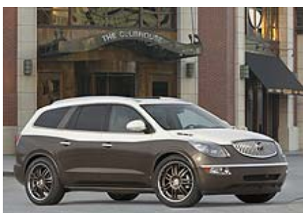
Buick Enclave Uptown.

"Uptown." The phrase conjures images of sophisticated luxury – timeless elegance with a flavor for the avant-garde. It is fine furnishings and the latest electronics, cool jazz with an equal dose of hot salsa. It's the blending of two colors to create a distinctive new shade. That's the premise behind the Buick Enclave UpTown, created by Rick Bottom Designs of Mendota, Ill.