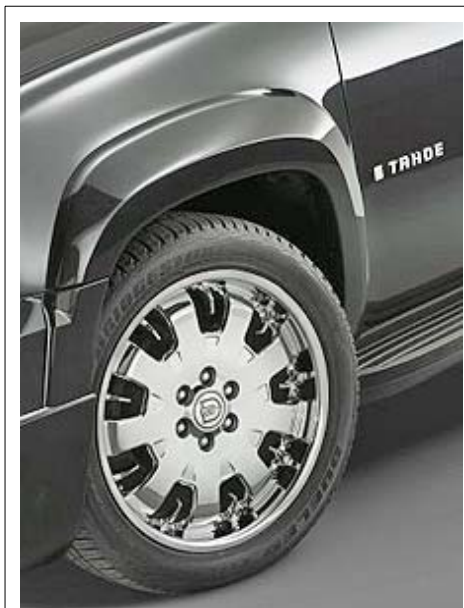
Chevrolet Tahoe Street Tuner with D22 Wheels..